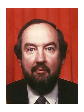
BEFORE DELIVERANCE AND HEALING showing the "gates of brass and bars of iron" around my mind requiring the power of Jesus to shatter once and for all.

Wipe away my sins that were atoned for on the Cross of Calvary by Jesus in order that I might not have to die eternally. I believe that Jesus took all my sins and my sorrows and made them His very own and after three days He rose again from the dead and now makes intercession for me. By the power of His shed blood, I believe I am now set free and opened up to all the resources of His grace and power. I am looking forward to the day – why not today – when the evil bondage of schizophrenia surrounding my mind is totally defeated. I ask You, Heavenly Father, to help me drive out the dark, spiritual presence by the light of your conquering Resurrection Presence. I want to know the reality of your promise that whoever follows you shall not walk in darkness but shall have the Light of Life. Make it happen for me I pray in the Mighty Name of Jesus, Amen.