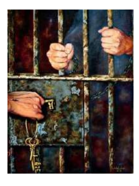
THE GATES OF HELL SHALL NOT PREVAIL by Rebekah Laue of Pagosa Springs, Colorado, U.S.A.

showing the strong "gates of brass and bars of iron" behind my eyes and around my mind requiring the power of JESUS CHRIST to defeat.