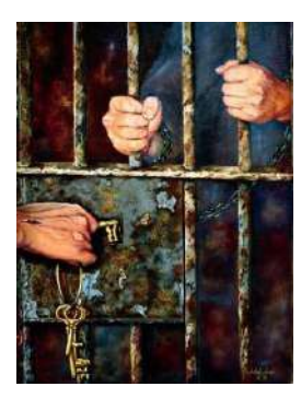
THE GATES OF HELL SHALL NOT PREVAIL by Rebekah Laue of Pagosa Springs, Colorado, U.S.A.

showing the strong "gates of brass and bars of iron" behind my eyes and around my mind requiring the power of JESUS CHRIST to defeat.