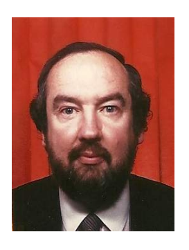
HEALING showing the "gates of brass and bars of iron" around my mind requiring the power of Jesus to shatter once and for all.

See below in the pictures BEFORE AND AFTER deliverance and healing, the visible difference made by the power of the Holy Spirit on my great day of freedom in May 1990.