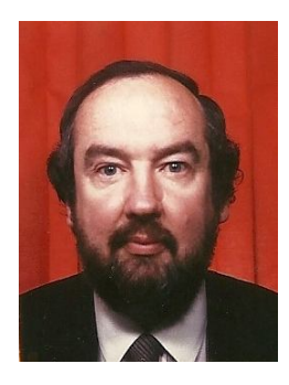
BEFORE DELIVERANCE AND HEALING showing the "gates of brass and bars of iron" around my mind requiring the power of Jesus to shatter once and for all.

See below in the pictures BEFORE AND AFTER deliverance and healing, the visible difference made by the power of the Holy Spirit on my great day of freedom in May 1990.