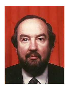
BEFORE DELIVERANCE AND HEALING showing the "gates of brass and bars of iron" around my mind requiring the power of Jesus to

spiritual presence by the light of your conquering Resurrection Presence. I want to know the reality of your promise that whoever follows you shall not walk in darkness but shall have the Light of Life. Make it happen for me I pray in the Mighty Name of Jesus, Amen.