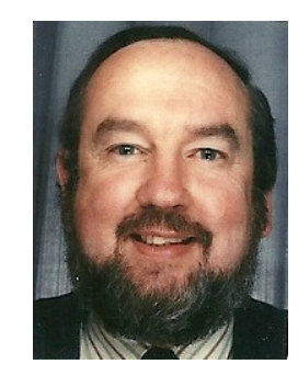
AFTER DELIVERANCE AND HEALING picture taken at 6.15 a.m. at Derby Railway Station five days after Jesus set me free, on my way to show Tina "her new man"