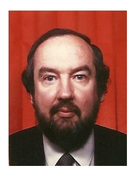
BEFORE DELIVERANCE AND HEALING showing the "gates of brass and bars of iron" around my mind requiring the power of Jesus to shatter once and for all.

See below in the pictures BEFORE AND AFTER deliverance and healing, the visible difference made by the power of the Holy Spirit on my great day of freedom in May 1990.