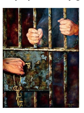
THE GATES OF HELL SHALL NOT PREVAIL

showing the "gates of brass and bars of iron" around my mind requiring the power of Jesus to shatter once and for all.