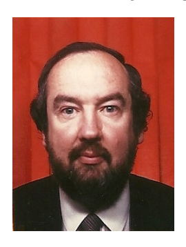
BEFORE DELIVERANCE AND HEALING

See below in the pictures BEFORE AND AFTER deliverance and healing, the visible difference made by the power of the Holy Spirit on my great day of freedom in May 1990.