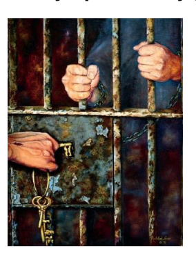
THE GATES OF HELL SHALL NOT PREVAIL

showing the "gates of brass and bars of iron" around my mind requiring the power of Jesus to shatter once and for all.