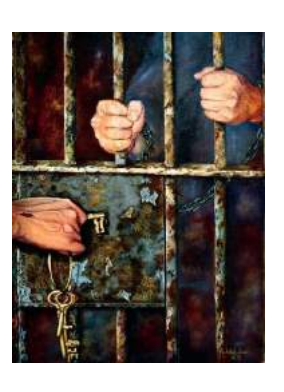
THE GATES OF HELL SHALL NOT PREVAIL

showing the "gates of brass and bars of iron" around my mind requiring the power of Jesus to shatter once and for all.