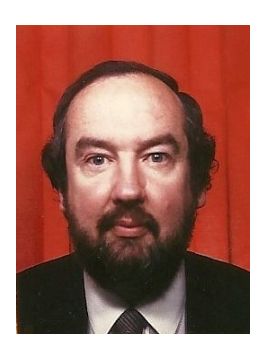
BEFORE DELIVERANCE AND HEALING showing the "gates of brass and bars of iron" around my mind requiring the power of Jesus to shatter once and for all.

See below in the pictures BEFORE AND AFTER deliverance and healing, the visible difference made by the power of the Holy Spirit on my great day of freedom in May 1990.