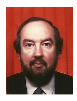
BEFORE DELIVERANCE AND HEALING

See below in the pictures BEFORE AND AFTER deliverance and healing, the visible difference made by the power of the Holy Spirit on my great day of freedom in May 1990.