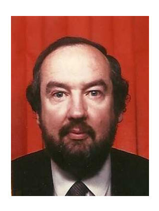
BEFORE DELIVERANCE AND HEALING

showing the "gates of brass and bars of iron" around my mind requiring the power of Jesus to shatter once and for all.